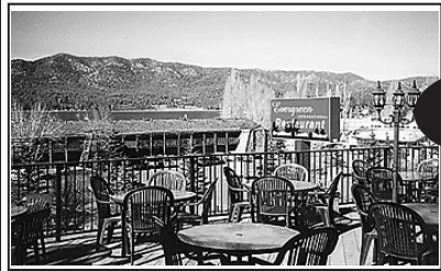
Big Bear's Largest Scenic Deck